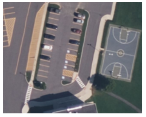
Addison District Office

For safety purposes, all cars in the loop are to remain in their order of arrival/entry.