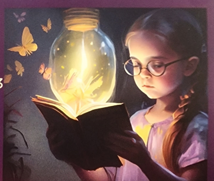
First Day for Friends Members Only Join or Renew at the Door!

Last Day Bag & Box Sale Cash or Checks Only